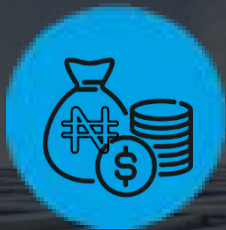
FINANCIAL SERVICE INDUSTRY

For close to three decades, we have been involved in providing critical capacity support to various sectors of the Nigerian economy including the: