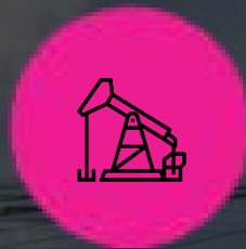
OIL AND GAS INDUSTRY